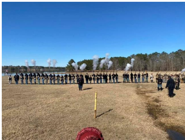
The reenactors fire a volley after the Saturday battle at Archusa Creek.