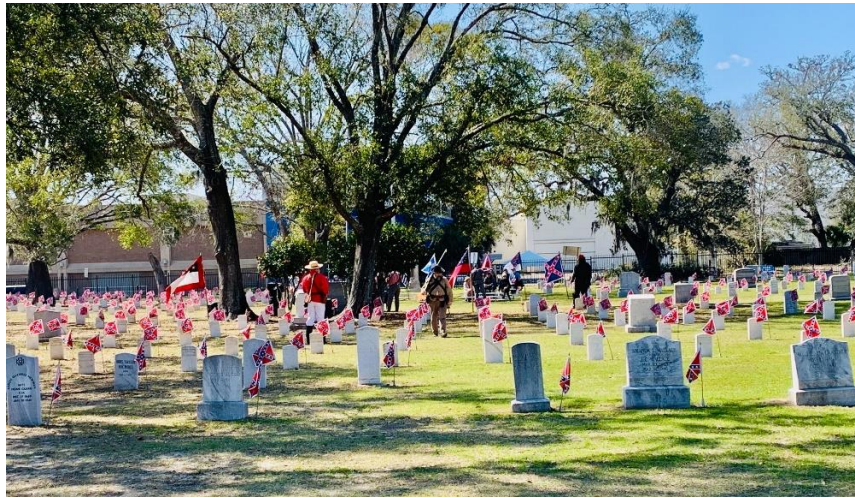
The Confederate Flags were put out in the cemetery for the ceremonies.