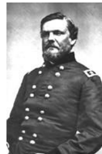
Brigadier General John Newton