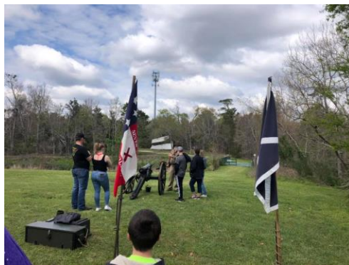
Spectators get a lesson on artillery at 3 rd Saturday Living History March 20, 2021.