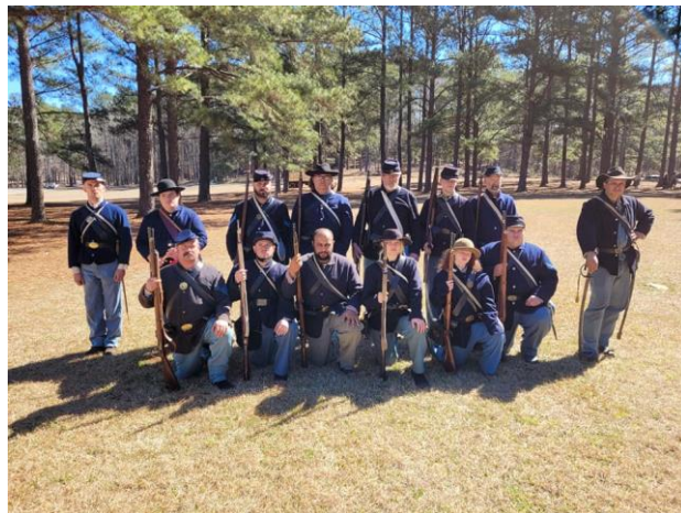
The 3 rd Miss Inf portrayed the 9 th Conn. Inf. at Quitman both days of the event.