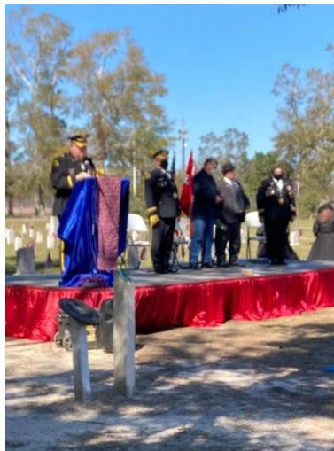
The Oddfellows held their annual Pilgrimage at Beauvoir on February 20, 2021.