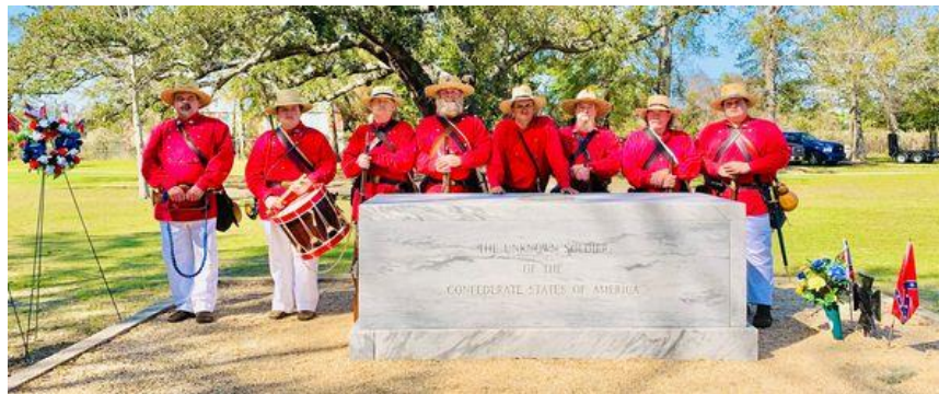
The 3 rd Miss. Inf. posed for a photo at the Tomb on March 6, 2021.