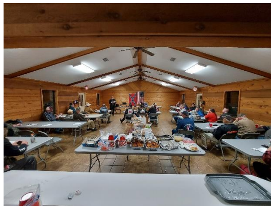
11 out of 13 Camps were represented at the Brigade Meeting with a large food spread.