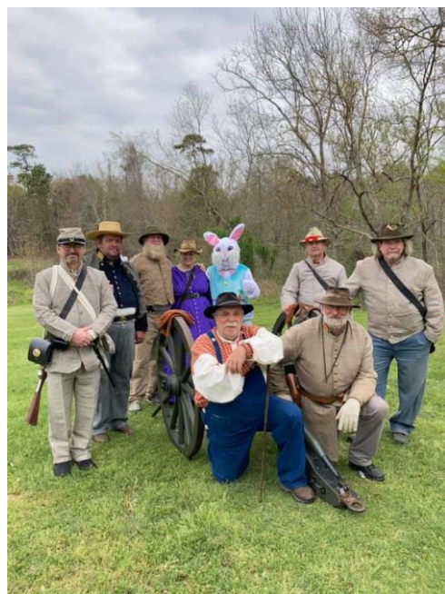
Living Historians pose for a photo around the cannon at Beauvoir.