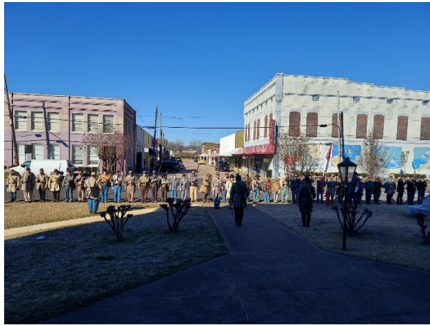
The reenactors are posted at the Quitman Courthouse February 20, 2021.